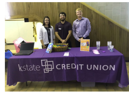
The team poses for a picture with their table set up at the event.