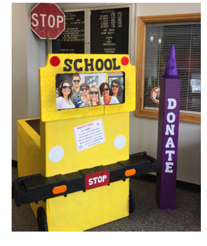
The Campus branch created a memorable lobby display that resulted in many school supply donations.

A special THANK YOU to Manhattan Broadcasting for using all 6 stations to help us promote.