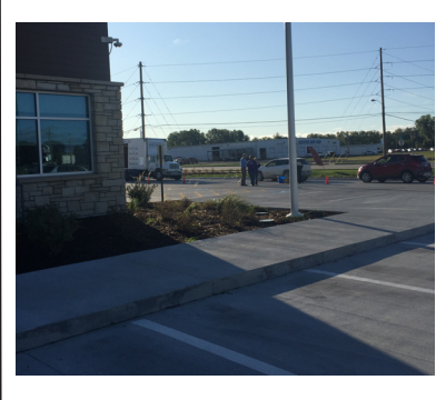
Cars line up in the 601 McCall Road parking lot for the free shred event.

Members have asked for kstate CREDIT UNION to host a community shred event and the opportunity was given on Saturday, October 7. Credit union members and community members arrived at our 601 McCall Road location and safely disposed of their important household paper documents. In addition to the event, kstate CREDIT UNION collected food items for the Flint Hills Breadbasket as a way to give back to our community and SHRED HUNGER. In the two hours of the event there was 95 lbs of food collected and $15 of cash donated. The event was such a success that Document Resources is already reserving a Saturday in Fall 2018 for the credit union to host another event.