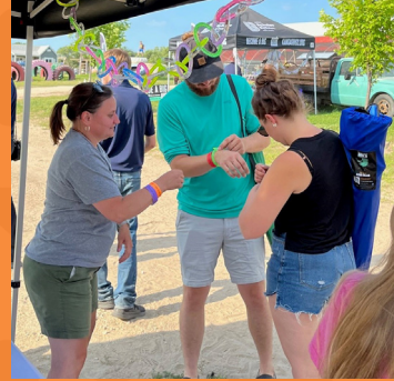
Red Dirt Saturday