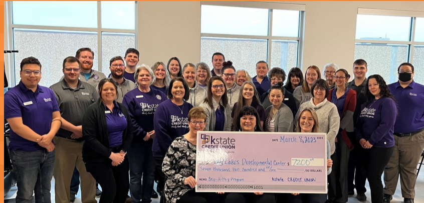
Big Lakes donation $7,200 (Skip-A-Pay 2022)