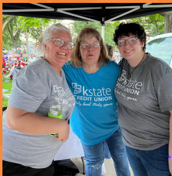
Arts in the Park