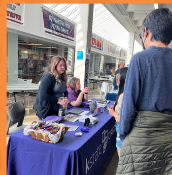
MHS Career Fair