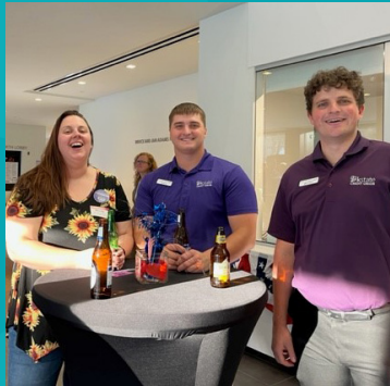
Business After Hours