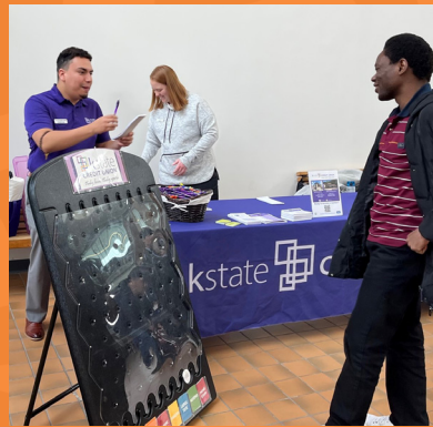
KSU International Student Fair