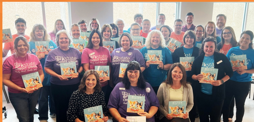
Milton Books donated to No Stone Unturned