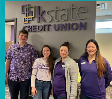
Our Team Members