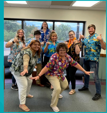
Our Team Members