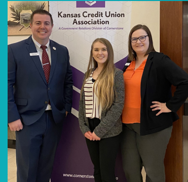
Day at the Capitol